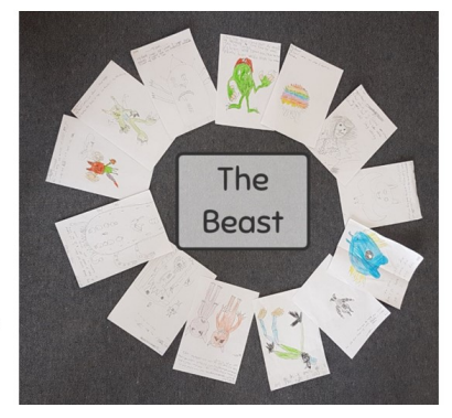
Here are some of our interpretations of our 'Beast' like emotions.

You can find out more by following along with Mojo and his friends at <a href="https://ideas.classdojo.com/">https://ideas.classdojo.com/</a>